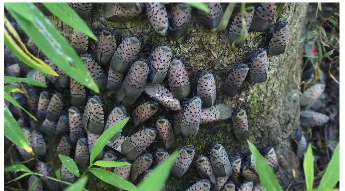
Adult Spotted Lanternfly - Group feeding A large group of spotted lanternfly adults, feeding at the base of a tree.