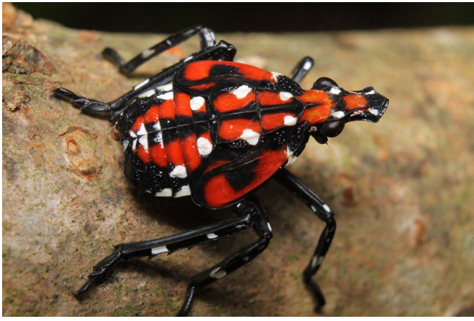
Late Stage Nymph of Spotted Lanternfly A late stage nymph (4th instars). These are the last nymph stage before becoming adults. They are ~1/2 inch long, and are bright red, covered in black stripes and white spots. They are strong jumpers, and will jump when prodded or frightened.