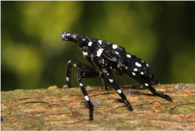
Early Stage Nymph of Spotted Lanternfly An early stage nymph (1st-3rd instars). These hatch from the eggs and are just a few centimeters in length. As they age, they grow to be ~1/4 inch long. They have black bodies and legs, and are covered in bright white spots. They are strong jumpers, and will jump when prodded or frightened.