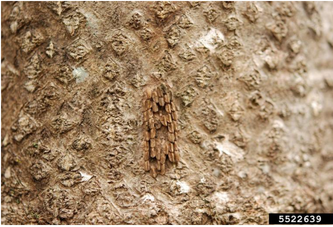
Spotted Lanternfly Egg Masses - Old Old egg masses, which have the putty or mud-like covering worn off. Here, you can see each individual seed-like egg.