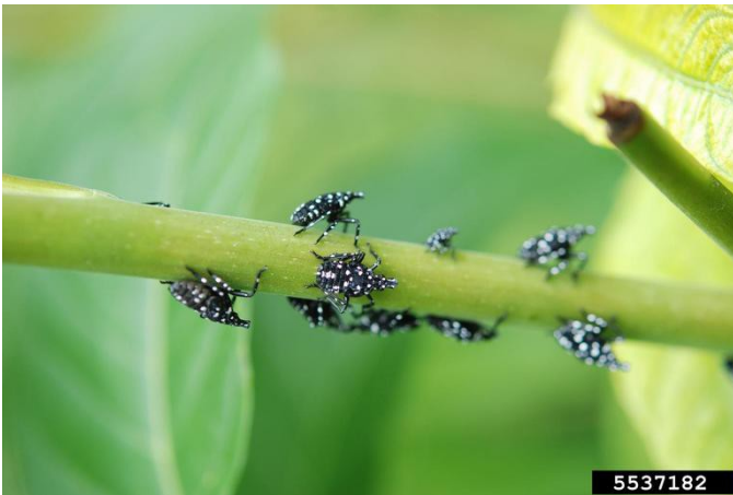
Early Stage Nymphs of Spotted Lanternfly Feeding Several early stage nymphs feeding on a tree-of-heaven. Early instars tend to feed on the new growth of a plant, such as the stems and foliage.