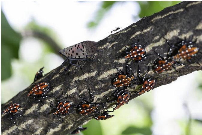
Late Stage Nymphs and Adult Spotted Lanternfly A group of the late stage 4th instar nymphs, and an adult.