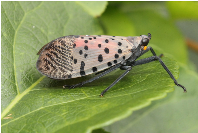
Adult Spotted Lanternfly - Side-view The side-view of a spotted lanternfly adult.