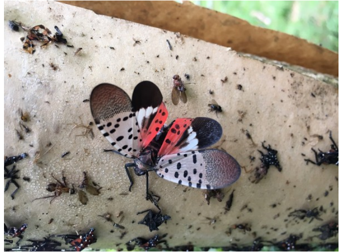
Adult Spotted Lanternfly- Open-wings An adult spotted lanternfly with its wings open. While spotted lanternfly adults can fly, they often prefer to jump and glide. You will see their wings when they are flying and gliding. You may also see them when they are frightened, or when they have been poisoned with an insecticide.